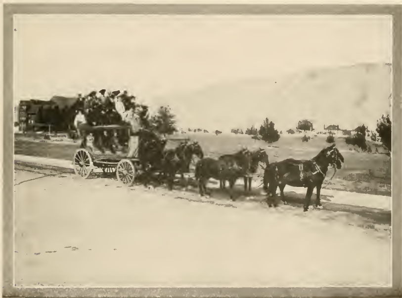
TRANSPORTATION COMPANY'S COACHES AT MAMMOTH HOT SPRINGS

Travelers through Wonderland have the choice of stopping at fine hotels—described elsewhere in this pamphlet—between which they are conveyed in modern stage coaches or surreys, or at camps, permanent or movable, between which they are carried in comfortable conveyances. On either the hotel trip or the camping trip saddle-horses are obtainable if desirable, at established rates. The hotels and the camps, with their