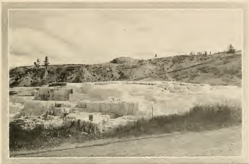
HYMEN TERRACE, BEAUTIFULLY TINTED, MAMMOTH HOT SPRINGS

Near Tower fall there is fine trouting. There, some twenty miles from Mammoth Hot Springs, the Yellowstone river, below the Grand Canyon, is a large stream with wide bends and pools and the trout are large and gamey.