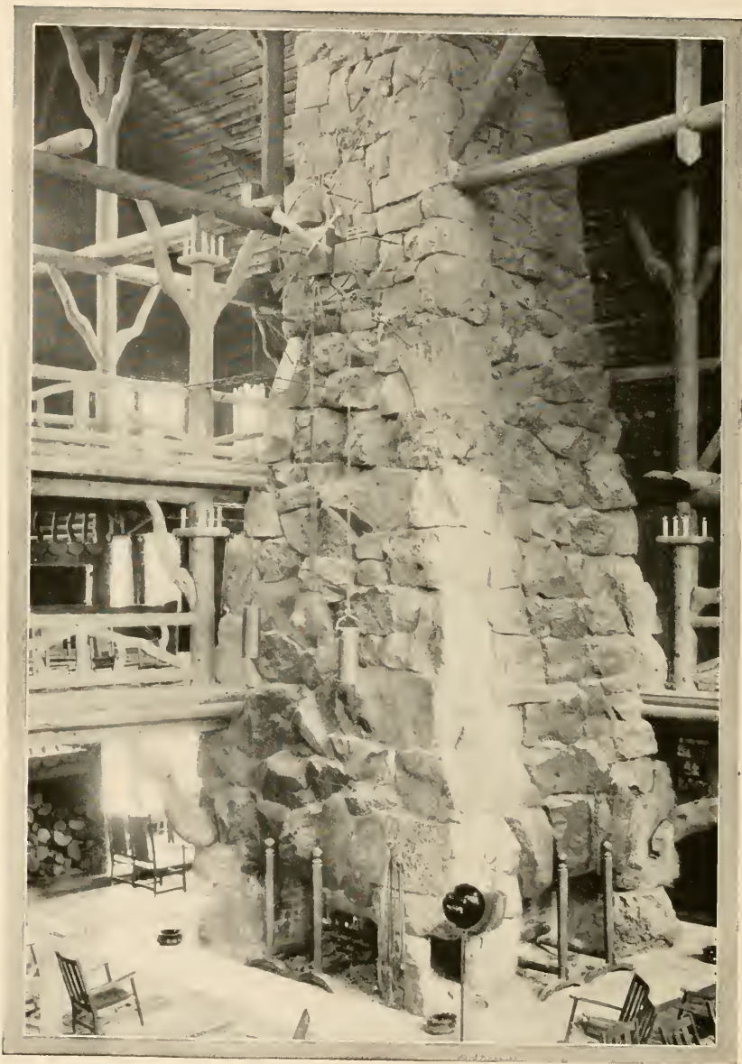
MAMMOTH FIREPLACE—CENTER OF OLD FAITHFUL INN, UPPER GEYSER BASIN, YELLOWSTONE PARK