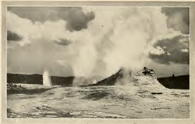
CASTLE, BEEHIVE, AND OLD FAITHFUL GEYSERS, UPPER GEYSER BASIN

merly, but one steam geyser, the Black Growler, was found here, but in recent years other "steamers" have broken forth, thus adding interest to the spot.