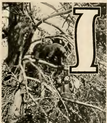
(NOTE MAN IN TREE ENTICING BEAR WITH TID-BITS.)

An ideal place to spend the summer vacation: a week is good, a month is better, three months is best!