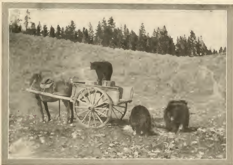
BEARS LUNCHING AT GRAND CANYON HOTEL

In portions of the park, naturally those somewhat retired and secluded, there are some moose, and there are also many beavers, flourishing and increasing in numbers. One place where these industrious animals may be seen is near Tower fall, where there are several colonies of them. Here, among the brooks in this beautiful part of the park, they may be found, with their dams, houses, ponds, and slides, swimming about in the water or cutting down trees on land, laying in their store of food for the winter. The Upper Yellowstone River, above the lake, is also a favorite habitat of the beaver, as are the beds of various streams flowing into the lake.