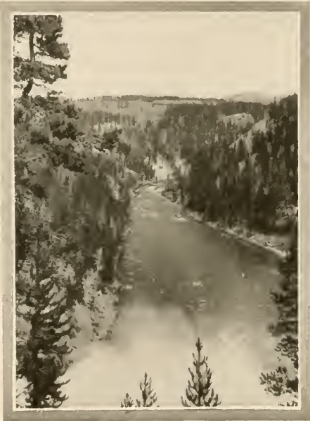
YELLOWSTONE RIVER FROM BRINK OF UPPER FALL, CANYON HOTEL IN DISTANCE

There are beautiful camping and outing spots on the borders of Yellowstone lake and in the neighboring mountains. The boat company operating on Yellowstone lake, with its fleet of various sized motor and row boats, enables guests at the Lake Colonial hotel and at the several permanent or other camps on the lake, to make fishing or pleasure excursions about the lake or to make special camps here and there, with the hotel and regular camps as centers from which to radiate. Those remaining here for several days should certainly make use of the boats to acquaint themselves with the beauties of the remoter shores of the lake.