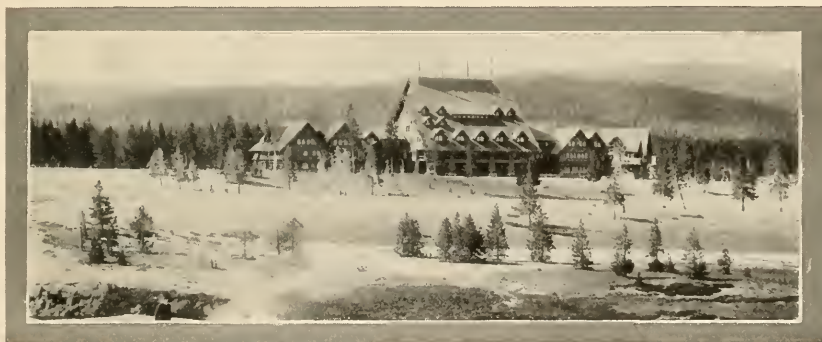
OLD FAITHFUL INN, UPPER GEYSER BASIN

The forests of the Park abound in peculiar tree growths. These abnormal growths are in perfect keeping with the unusual character of this Wonderland, and enter prominently into the construction of Old Faithful Inn, which is thus a unique hotel home in a unique land. The Inn is a thoroughly modern and artistic structure in every respect and represents an expenditure approaching $200,000. Electric lights and bells,