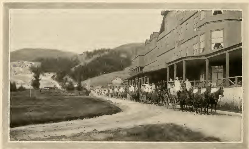
A LINE OF STAGE COACHES, MAMMOTH HOT SPRINGS—THE YELLOWSTONE PARK TRANSPORTATION COMPANY HAS BETWEEN 600 AND 1,000 HORSES.

While the tour of five and a half days within the Park, which is the scheduled trip, enables the visitor to view, practically, everything of note, there are numerous points of interest which can not be thoroughly seen and enjoyed without a lay-over, and extra time will always prove to be time enjoyably and profitably spent.