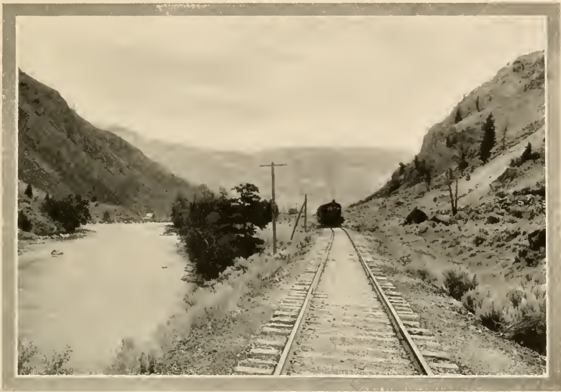
ALONG THE YELLOWSTONE PARK LINE BETWEEN LIVINGSTON AND GARDINER.