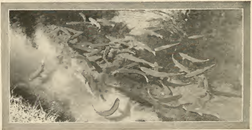
TROUT IN YELLOWSTONE RIVER

There is now scarcely a stream or lake in the park but that has trout in it. From any of the hotels one can easily make fishing excursions, at distances ranging from a few rods to a few miles, and find fine sport. Those who angle in Yellowstone Park are under few restrictions, but they are assumed to be true sportsmen. All fish must be taken with a hook and line. At Yellowstone lake the fish may be taken either by casting or trolling. The lake trout are easily caught, even by those unaccustomed to fishing. For those who are adepts at angling, the most desirable spot at this point is in the Yellowstone river, below the outlet of the lake. Boats and fishing tackle for those who do not have their own, can be procured here. At Upper geyser basin trout can be taken anywhere in the Firehole river even though it is largely composed of warm water from the geysers. At Grand Canyon a favorite fishing spot is the reach of the river between the Upper and Lower falls, while another good place is the "Fishing Hole," seven miles from the Canyon Hotel by trail down the precipitous canyon wall.