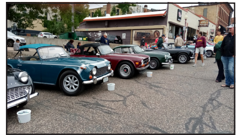
The British invade the YT

Hudson (WI) YT Heritage Day Again there was a British flair to Hudson's Yellowstone Trail Heritage Day Aug. 13. Austin Healeys, MGs and all things British filled a whole block. There may have been a Land Rover (very crowded to see for sure). Vintage and Classic cars were present also. There were so many that some overflowed the allotted space. Others were placed on the historic "dyke" which was the Yellowstone Trail route and bridge to Minnesota.