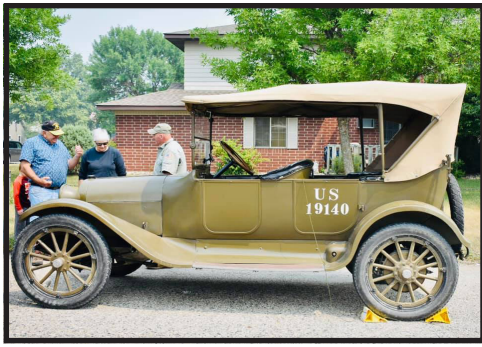
WW I Staff Car - YT Alliance of W. MN

Reports from South Dakota, Minnesota and Wisconsin say that the crowds were certainly out. Yellowstone Trail members and friends have knocked themselves out preparing for the convoy.