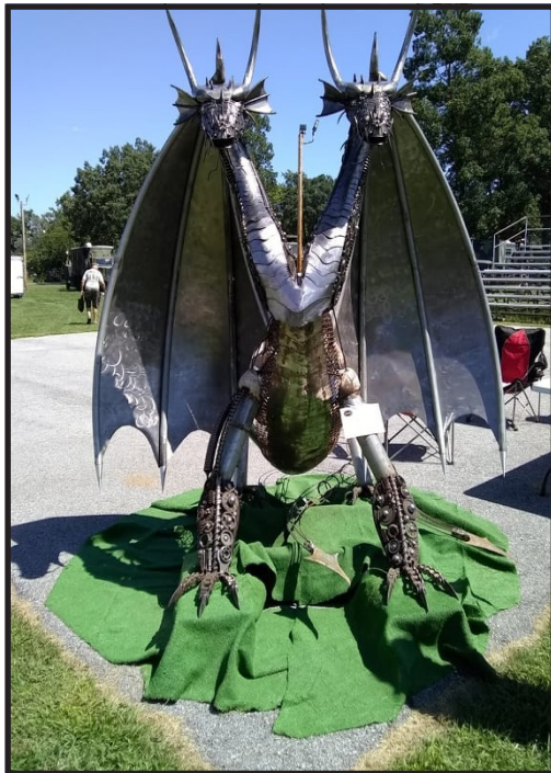
A two-headed dragon won the scrap metal sculpture contest in Hamlet.