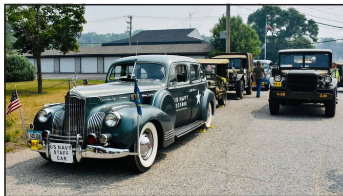
1941 Packard Navy Staff Car