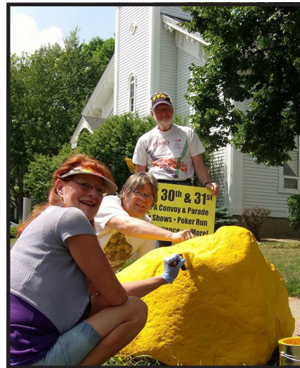
Getting the Yellowstone Heritage Days ready in Hudson