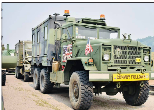
5-ton Army Truck

bit in Minnesota in order to avoid the Twin Cities. In Wisconsin, the convoy avoided Milwaukee and Chicago traffic and left the Trail in Oshkosh going north over the top of Lake Michigan. Dropping down through Michigan, the convoy re-joined the Trail in Indiana to Conneaut, Ohio, for their extraordinary re-enactment of D-Day. →