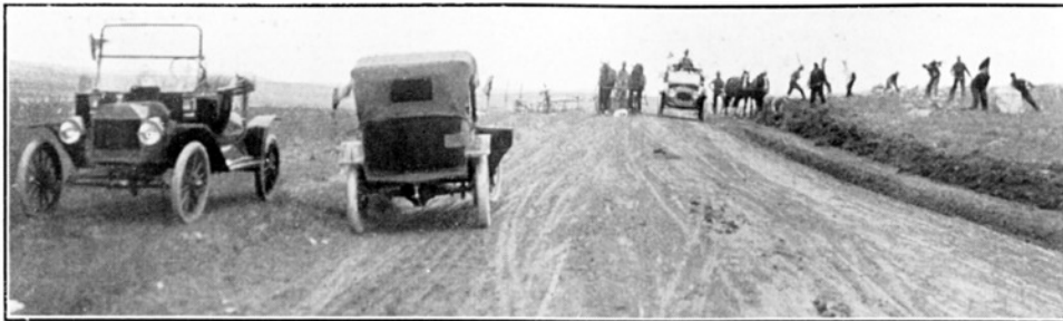
Trail Day workers at Hettinger, ND May 22, 1914

Members of the Association realized that if the road was going to get built, it would have to be built a different way. Through the work of Association members and with the help of local citizens, Trail Days were organized to "excite and encourage" people of small towns on the route to take charge of building the Yellowstone Trail. For Trail Days, local citizens brought their own teams of horses and mules, and their own picks, shovels, discs, harrows or road drags. Out of old lumber, old railroad ties, old binder frames, old haystack frames or anything else handy, they improvised other needed equipment.