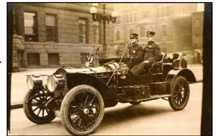
Local Police often had older and slower cars

Many harrowing chases ensued over the years. One runner was killed on the YT near Taft, Montana, when his truck tipped over during a chase. In another incident, police captured two runners after a 70 mile chase at high speeds.