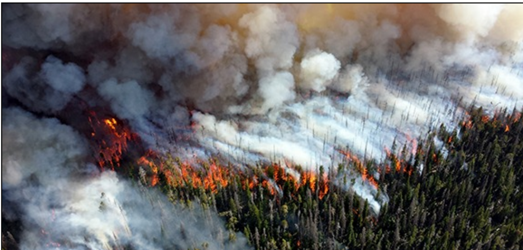
Crown fire in the Druid Complex, Yellowstone National Park, August 19, 2013

At 82, I know I won’t go back, but there is a pulloff on the park road near West Thumb where one can stop and see a little sliver of Shoshone Lake, five miles away. Stop I always do. And I smile.