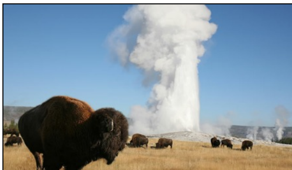
Buffalo graze near Old Faithful Geyser

Species also come in voluntarily. In Autumn 2000 I heard that a mountain goat had been spotted in the park. They were common 250 miles northwest in Glacier National Park, but not in Yellowstone. I looked, but found none. Fourteen years later, they have established themselves – without being trucked in – in the northeast