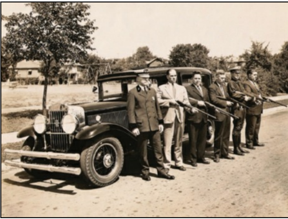
“Flying Squads” of Federal agents pursued rum-runners