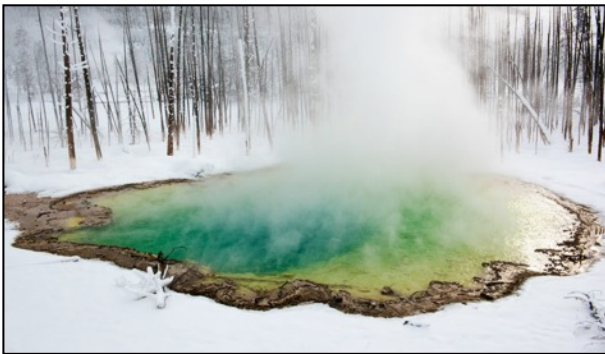
Norris Cistern Springs Geyser

People like me who are nuts about Yellowstone tend to fall into two groups: animal watchers and geyser gazers. The groups are not co-exclusive. Though I am an animal watcher, I could spend the entire day around the features at Old Faithful and repeat it happily the next day. “Mesmerizing” is a word a friend used recently to describe the Old Girl, and She is just one of many. It always saddens me to sit among the devotees of Old Faithful, waiting for her to blow, and ignoring other grand things that are happening before their eyes, especially Beehive Geyser, just northwest of Old Faithful, easily visible from the seats there.