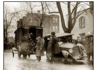
Rum-runners arrested after crash

On January 1, 1919 Montana voted to become "Dry" and the rest of the US went dry on January 26, 1920. This altered the routes the runners took. Now the hooch had to be smuggled in from Canada. This created new problems for the inland runners. Now they have an international border to cross. This meant bribing border agents. They also had to contend with hijackers. These are people who found it easier to hijack the runners instead of trying to smuggle the hooch across the border.