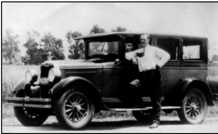
Rum-runners had big, fast cars and trucks

In 1915 Washington & Idaho voted to become "Dry States" by outlawing liquor sales on January 1, 1916. Even though liquor sales became illegal, the demand for it did not slow down. The citizens of Seattle had the luxury of the Puget Sound and could easily get the hooch from Canada. Spokane on the other hand is landlocked and needed a different way to procure the outlawed spirits.