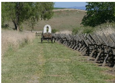
Oregon Trail in Washington

It is hard to impress this old roadie with a recreated scene, but this one left me in awe because it placed the participants in the real setting, not in a museum, or drawing. I was alone on the site and it was the same time of year they were passing this way. Special! A must see on the Yellowstone Trail.