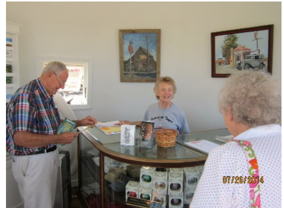
Visitors Center inside the Teapot - 2014

And look at it today! Moved to 117 First Avenue (YT) and refurbished finally in 2012, it serves as a visitor’s center in the new Teapot Dome Memorial Park on the west side of town. There, you will also find modern restroom facilities, a picnic area, ample parking and access to a biking / hiking trail. It is a quiet and comfortable spot for a true icon of the city of Zillah and the Yellowstone Trail.