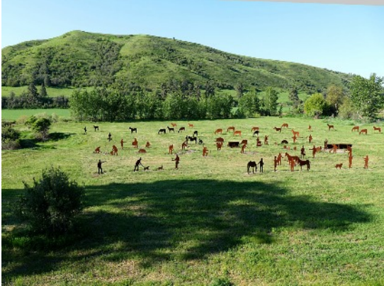
Lewis & Clark Camp near Dayton WA

The Yellowstone Trail, The Oregon Trail, and the Lewis and Clark trail all pass through the Walla Walla / Waitsburg / Dayton area of southeastern Washington. The 40 or so miles along the Yellowstone Trail between just west of Walla Walla at the Whitman Mission to Dayton is chock full of important history and magnificent sites to visit and enjoy, not to mention splendid accommodations and gourmet meals. I spent a day and evening in the area in early May.