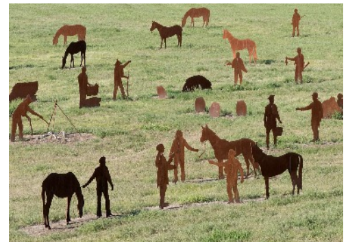
Lewis & Clark Camp near Dayton WA

In spring 1806, the Corps followed an ancient trail between the Columbia and Snake rivers traveled by American Indian tribes. The Corps started following this trail near the mouth of the Walla Walla River and then traveled along the Touchet River. After passing through the present-day vicinity of Prescott, Waitsburg, and Dayton and crossing the Touchet, they came to this little valley and camped along Patit Creek. This overland "shortcut" shaved many miles off their eastbound trek.