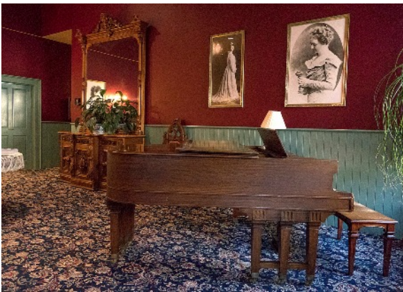
Weinhard Hotel in Dayton, WA

One of the advantages of our heritage road trails like the Yellowstone is that they are blessed with heritage accommodations. Jacob Weinhard, a nephew of the famed brew master, built the Weinhard Hotel and bar in Dayton in 1890. It has been beautifully restored, and the historic Waitsburg Rail Station is just behind the hotel. I spent the night in a comfortable room at the hotel and enjoyed the authentic period ambiance. The Weinhard Cafe across the street has a gourmet dinner menu, and I enjoyed a locally sourced salad with fresh berries, and a halibut main dish with asparagus and wild rice.