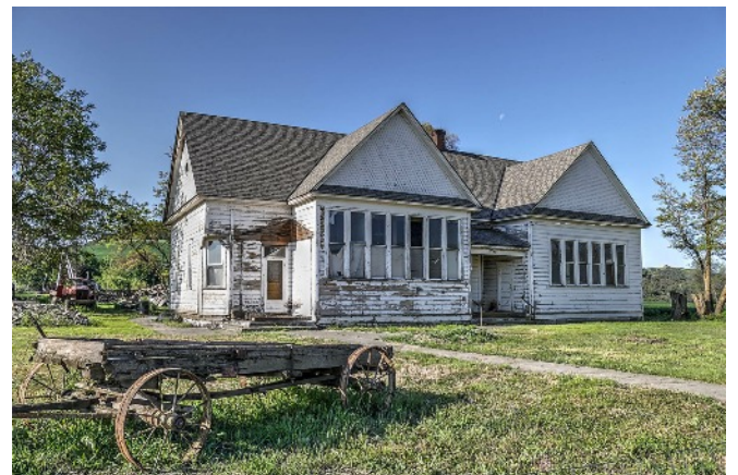
Columbia School in Dayton, WA

the original Yellowstone Trail that were evident as I drove the modern paved US12. But I couldn't resist taking a photo of the Columbia School. Coming into Dayton from the south in 1919 the Trail followed Columbia School Road, turning left (north) at the school. The school, built in 1903, was a waymark in the 1919 Automobile Blue Book describing the route of the Trail in those days.