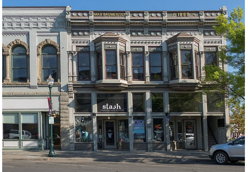
Baumeister building in Walla Walla, WA

In the late 1800's and into the time of our Yellowstone Trail, merchants and building owners often embellished their establishments with cast iron ornamentation that made plain brick structures appear quite lavish. While the most popular and widely used were produced by the Mesker foundries, just about any good sized town had a cast iron foundry and produced iron decorative and structural pieces. The Yellowstone Trail is a path leading to the door of many cast iron front buildings that were busy businesses serving locals and travelers on the Trail. I topped at four nice examples, including two hotels that served Trail travelers. The 1899 Baumeister building on Main Street in Walla Walla is a good example of cast iron fronts.