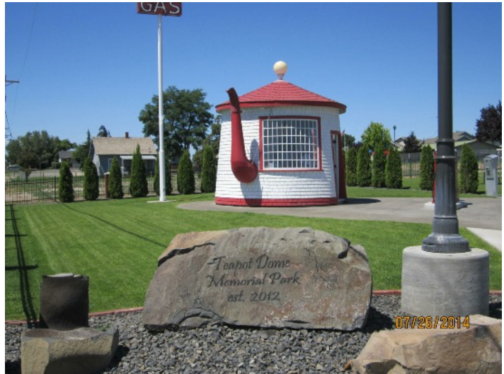
Teapot dedication rock - 2014

The circular frame building is sided with wood shingles, and has red asphalt shingles on the domed roof with a glass globe at the apex. It has a decorative sheet metal handle, and a concrete spout which served as a stovepipe for the wood-burning heater. There was an outhouse in the back.