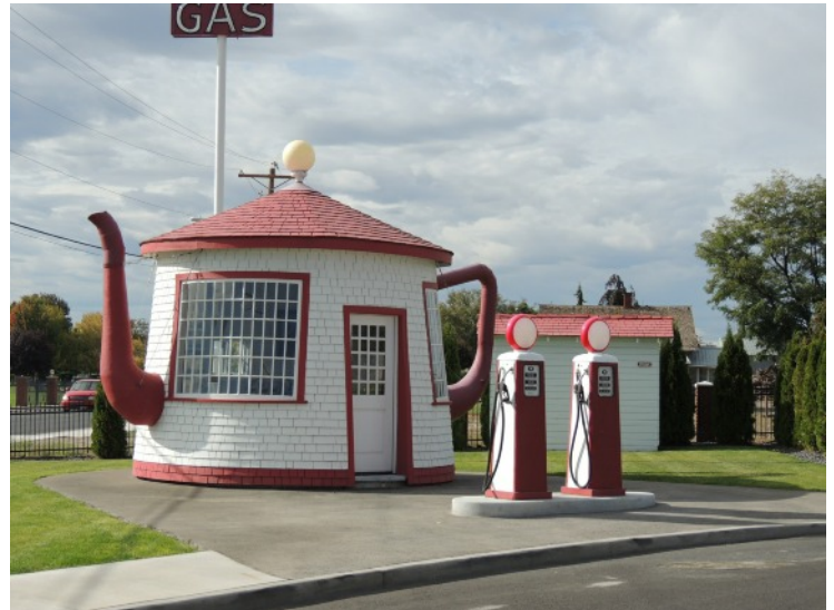
Teapot Gas Station in Zillah, WA