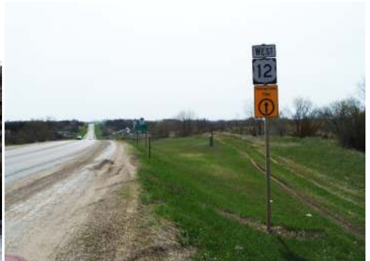
Much of US Hwy 12 in South Dakota is laid on top of the Trail.