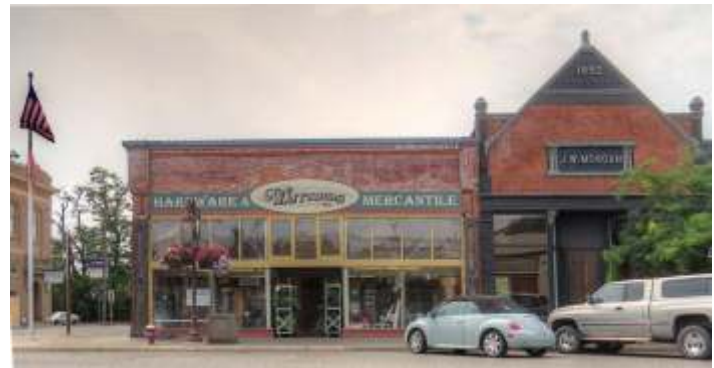
Waitsburg Hardware and Mercantile and 1892 Drug Store (also has a Mesker's Cast Iron Front)

If you want more about Waitsburg, Mesker cast iron fronts, or more views and tales along the Trail, visit the new Forum at www.yellowstonetrail.ipbhost.com ! We will be posting more there in the days ahead. You don't need an account to view the posts, but if you are a member of the Yellowstone Trail Association, you can comment, or post your own Trail experiences. «