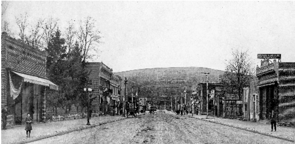
The Yellowstone Trail & Main Street through Waitsburg - Early 1900's

I know Waitsburg fairly well and stopped there many times years ago when I was a student at Washington State University in Pullman. It hasn't changed much since the 1910's image from the days of the Yellowstone Trail. The photographer who took the real photo post card image (below) was standing in the middle of the Yellowstone Trail looking north, which, as you might guess, is also Main Street.