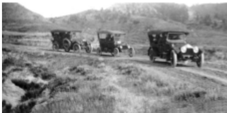
On the road to Yellowstone.

Dowling's Oakland . It is comprised of his mother's remembrances, a daily diary she wrote on the trip, and many pictures.