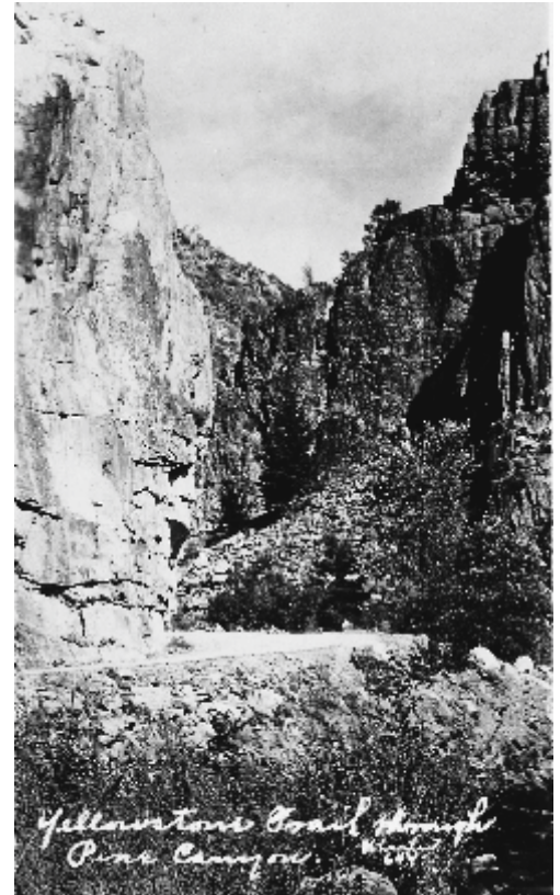
Two early scenes of the highway through the lower Corbaley Canyon.

Completion of the road was greeted enthusiastically both by travelers and commercial interests. The route was said to not have a "single turn around which cars cannot be seen." The original wagon road was in the canyon bottom and two years later spring runoff water from Pine Canyon Creek wiped out two miles of the road's lower section. Repair work was completed soon after and in 1923 and 1927 improvements were made. In 1930, the first Bituminous coating was laid on the road.