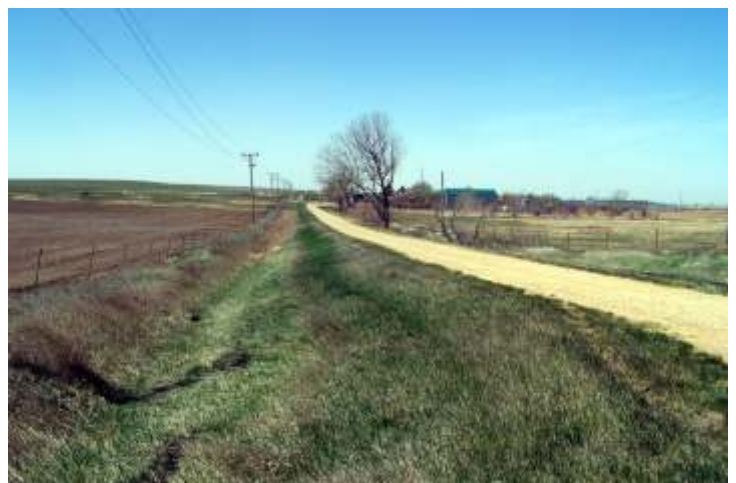
Some of the Trail as it looked 100 years ago