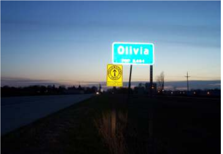
Olivia, MN at sunset