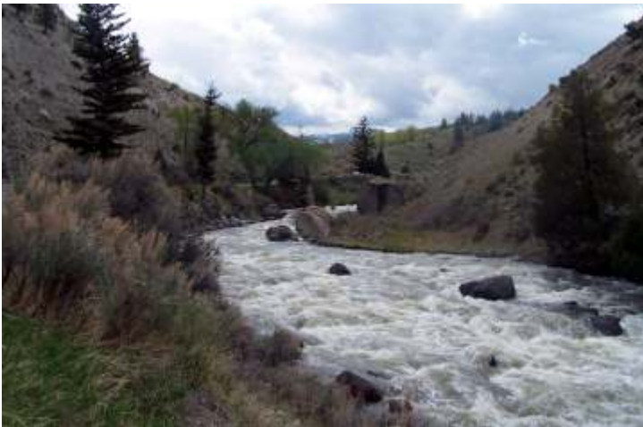
The Trail runs next to the Yellowstone River near Yankee Jim Canyon