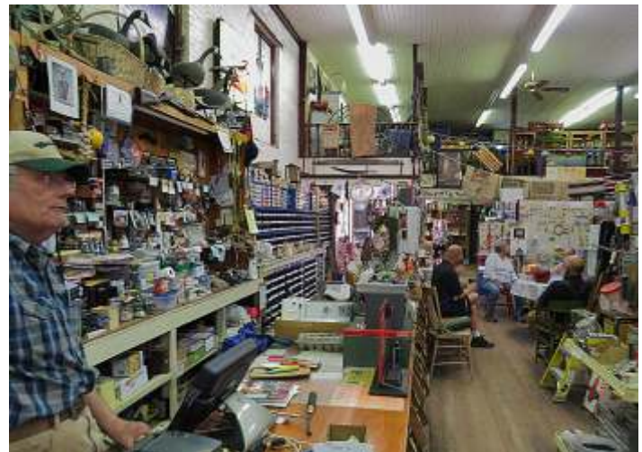
The Waitsburg Hardware and Mercantile interior.