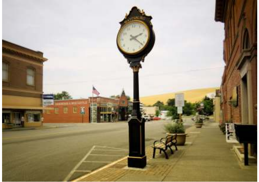
Main Street Waitsburg with Hardware Store behind Flag

When my wife, Sheila, and I drove the Trail late this summer between Walla Walla and Colfax in eastern Washington, I had no idea of the surprise that awaited me. The old route between Walla Walla and Colfax is fairly easy to follow. There are at least two fine abandoned YT bridges and one abandoned ferry crossing for those in the know. Visit the new Yellowstone Trail Forum on line if you want more details and some photos ( www.yellowstonetrail.ipbhost.com ). But the attention here is on Waitsburg.