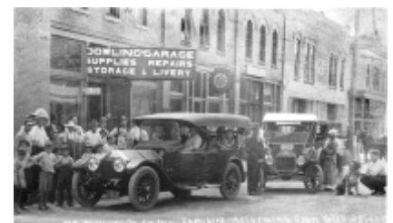
The hero's welcome home to Olivia, Minnesota.