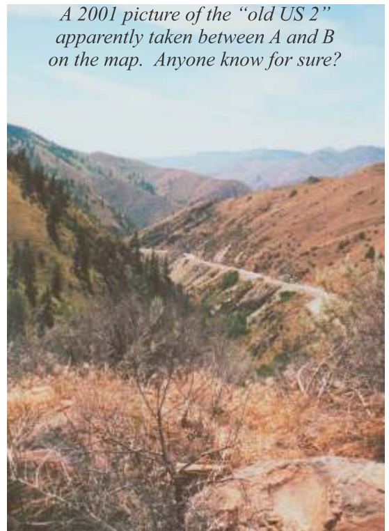
A 2001 picture of the "old US 2" apparently taken between A and B on the map. Anyone know for sure?