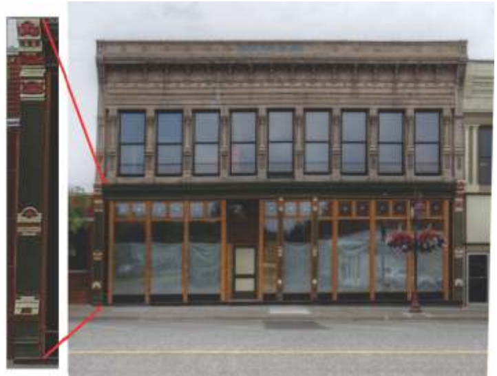
Bradley's Hotel today showing Mesker's Cast Iron Column Piece Enlarged

I photographed some of the other buildings in town, and as we were about to leave, I noted that the hardware store had an amazingly authentic look with period stock on display in the windows, so I thought it would be interesting to step inside.