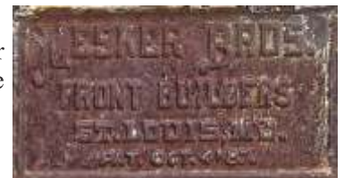
Mesker's Label on the Bradley Hotel Building

Waitsburg has four such Mesker's store fronts that are still standing, including the former Bradley's Hotel. The building looks in better shape today than a hundred years ago, and the cast iron is still evident, even down to the Mesker's label!