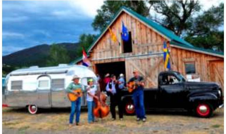
1948 Studebaker M5 pickup pulling '49 Curtis Wright Clipper, both owned by author