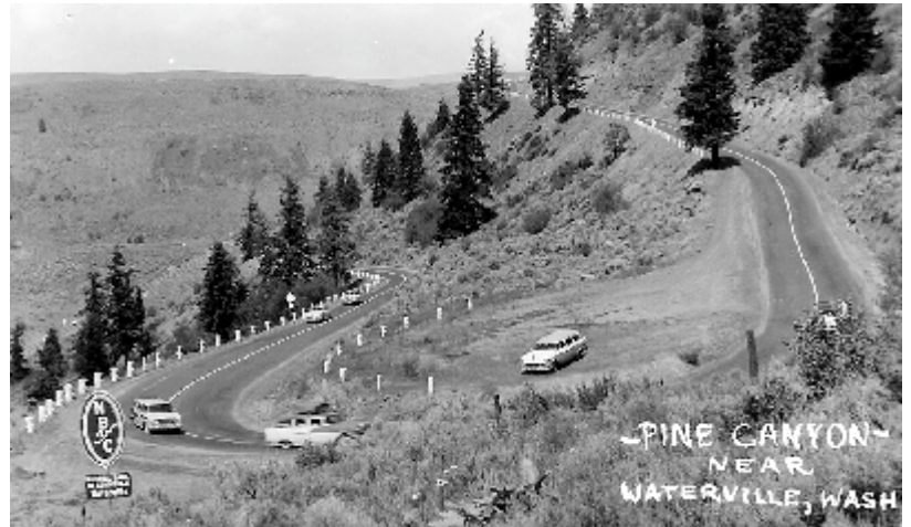
A late 1950's picture of the Pine Canyon route undoubtedly taken at point G on the map.

The reader is invited to provide clarifications, corrections, additional information, travel diaries, and stories to help document this section of the Yellowstone Trail. «