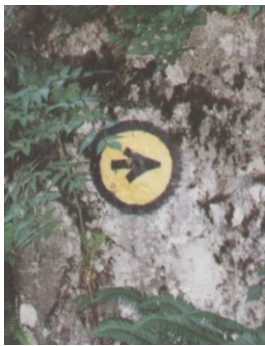
The US Forest Service keeps this original sign painted in Denny Park, Washington.

The Yellowstone Trail Association voted that summer of 1914 to adopt the "official" marker of a 12-inch