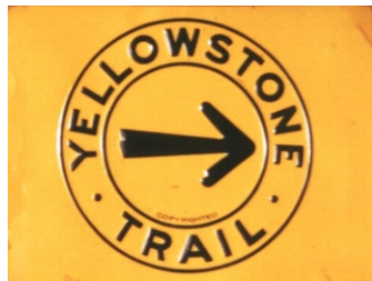
An original sign preserved in an attic near Watauga, South Dakota. But we are sworn to secrecy about its ownership!

With the arrival of state and federally numbered routes, the need for colored signs disappeared. Wisconsin had swept all colors from its highways in 1918 in favor of state numbers. However, it allowed the yellow signs to continue to mark the Yellowstone Trail because the Trail had been such a tourist draw and would soon be the only entirely paved route across the state. By the late 1920s, the Association had become a service much like today's AAA until route numbering and the Depression closed its doors in 1930.