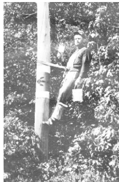
This guy just painted a Yellowstone Trail sign near Cadott, Wisconsin. But why is he so high up the pole?

Note: This article is adapted from an American Road Magazine article, Volume 2 Number 1, 2003, by Alice Ridge.