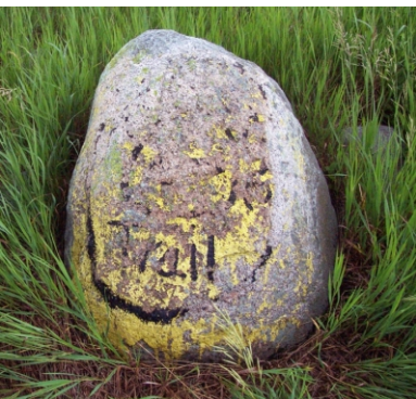
An original sign near Marvin, South Dakota. To find it you probably will need to cut back the tall grass!.

Most of the marking was done by local trailmen, but, apparently, college men were hired to spread yellow paint during the